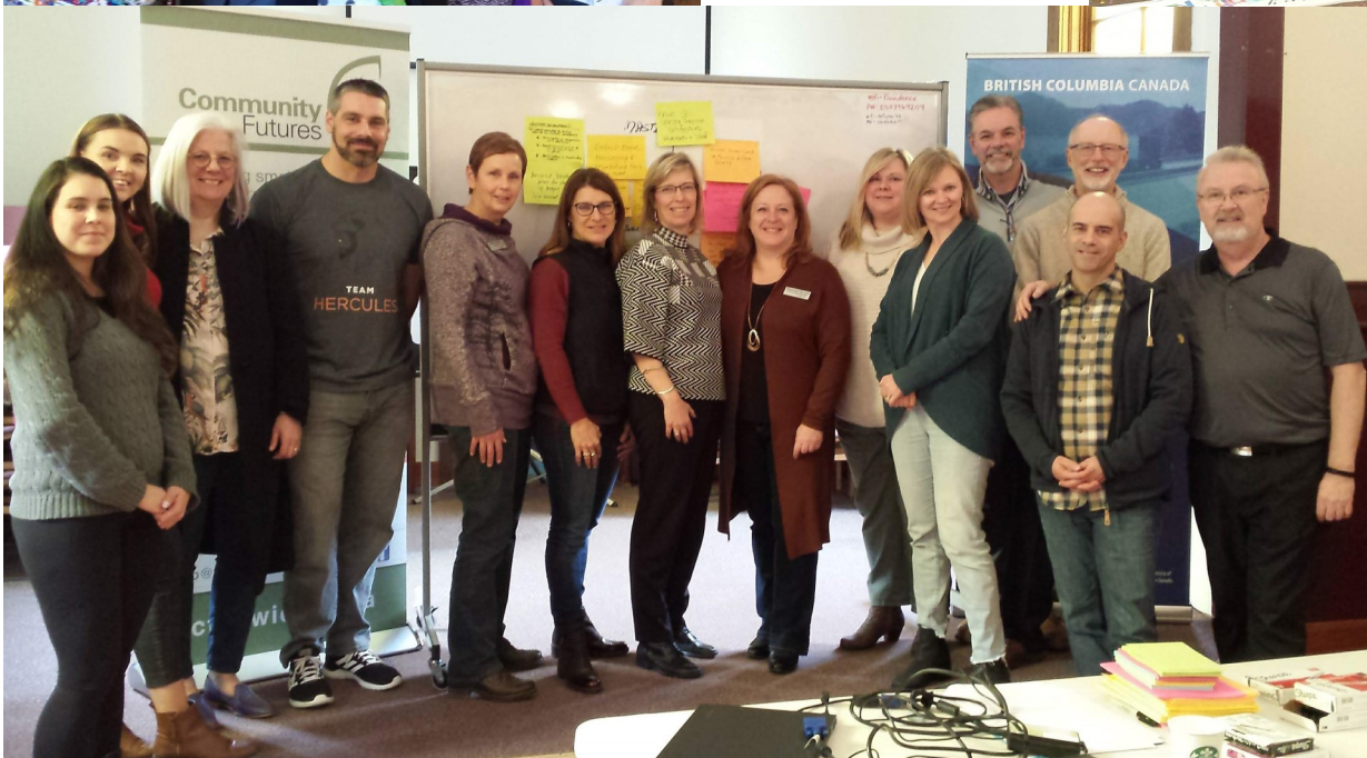
Strategic Planning at Providence Farm November 2019